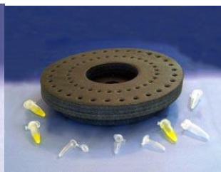
Microcentrifuge tube Accessory