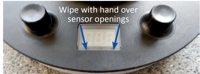
Activating the sensor

The device features an optical sensor for switching it on again. To switch it on, wipe with your hand over the display (see video).