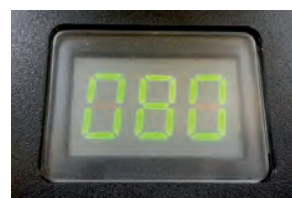
Display showing the selected temperature