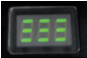
Cooling is running (2 minutes)