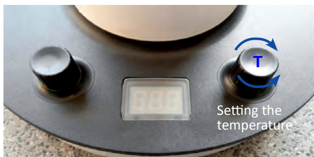
Function of the knobs

The temperature can be set using the right knob (T) and will be reached after about 5 seconds.