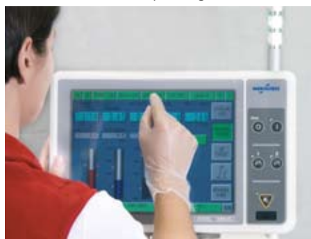
Intuitive operating via touch screen

The DBB-05 has been developed by operators, for operators and fits in perfectly with daily dialysis routines.