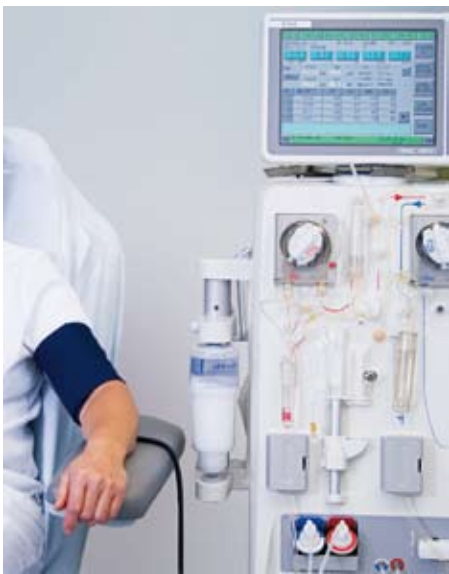
Active blood pressure measurement