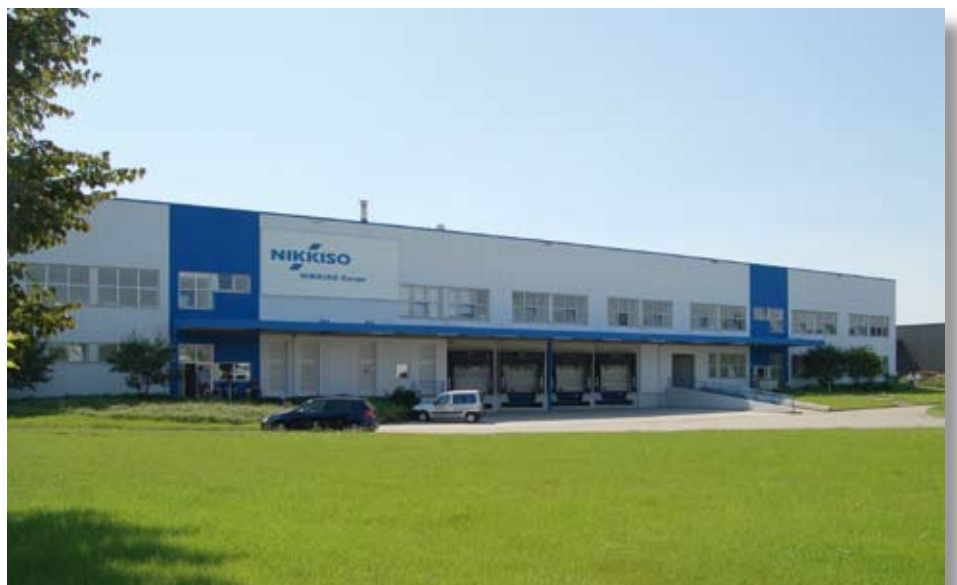
NIKKISO Europe Systems Production facility in Hanover-Langenhagen

This puts us in a position to respond to your requirements in a flexible, prompt and high-quality way – as is expected from the 'Made in Germany' tradition.