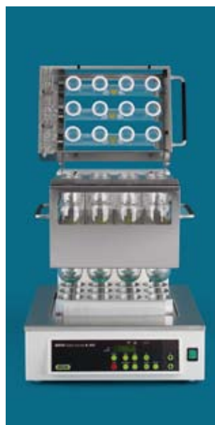
Digest Automat K-432