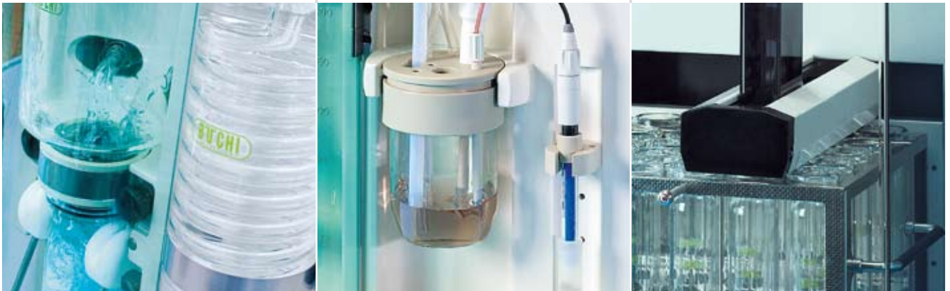
■ Distillation Unit K-350

Depending on their sample throughput, users may require extra integration and a greater degree of automation. Automation and integration solutions from BUCHI are designed to meet the requirements of demanding customers in terms of convenience and time savings.