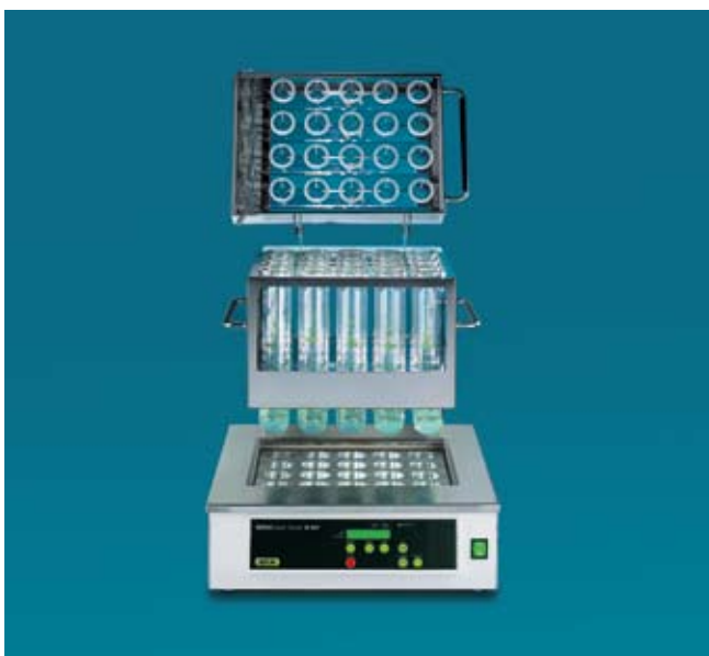
Digest System K-437