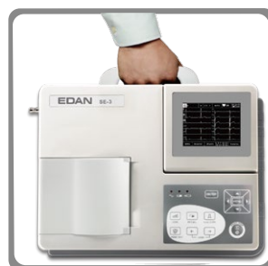
Portable Design (Handle Optional)