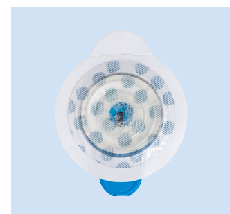
Printed release liner