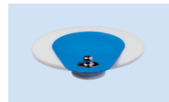
S = Stud