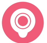
Double ring adhesive