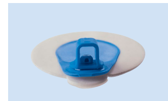
A = 4 mm fitting