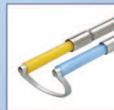
WA22623C Band Electrode for 30° telescopes