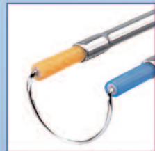
WA22603D Large Loop Electrode for 12° telescopes