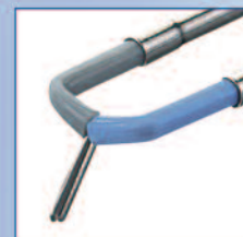
WA22655C 45° Needle Electrode for 12° and 30° telescopes