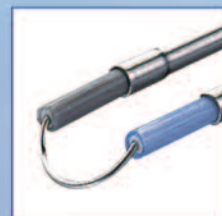
WA22632D Medium Loop Electrode 45° angled for 12° and 30° telescopes