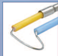
WA22607D Large Loop Electrode for 30° telescopes