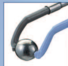
WA22651C Roller Ball Electrode for 12° and 30° telescopes