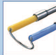
WA22606D Medium Loop Electrode for 30° telescopes