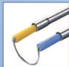
WA22602D Medium Loop Electrode for 12° telescopes