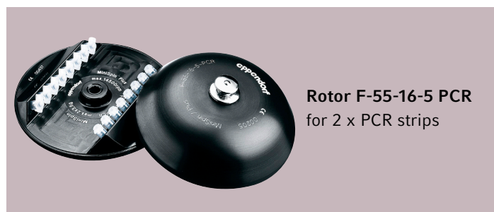
Rotor F-55-16-5 PCR for 2 x PCR strips