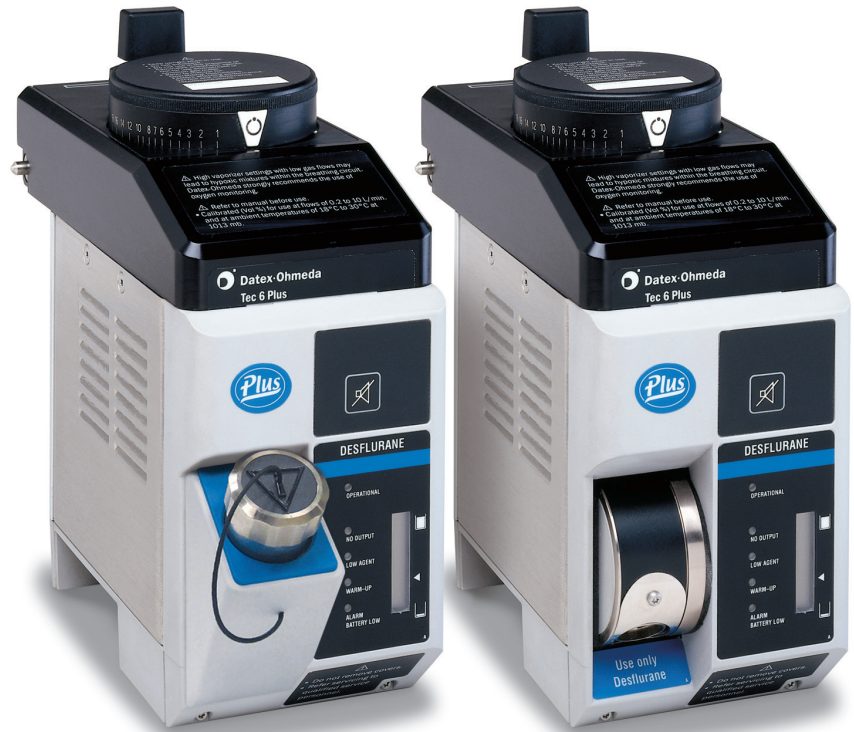
Tec 6 Plus Fixed Filler †