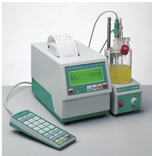
756 KF Coulometer equipped with a diaphragm cell and 728 Magnetic Stirrer after a water determination in an oil sample