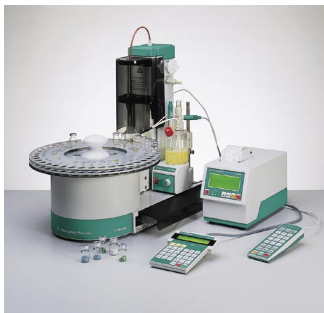
756 KF Coulometer with 774 Oven Sample Processor

As with the 768 KF Oven, the parameters of the 774 Oven Sample Processor can be printed out on the 756 KF Coulometer's built-in printer and/or on a common printer.