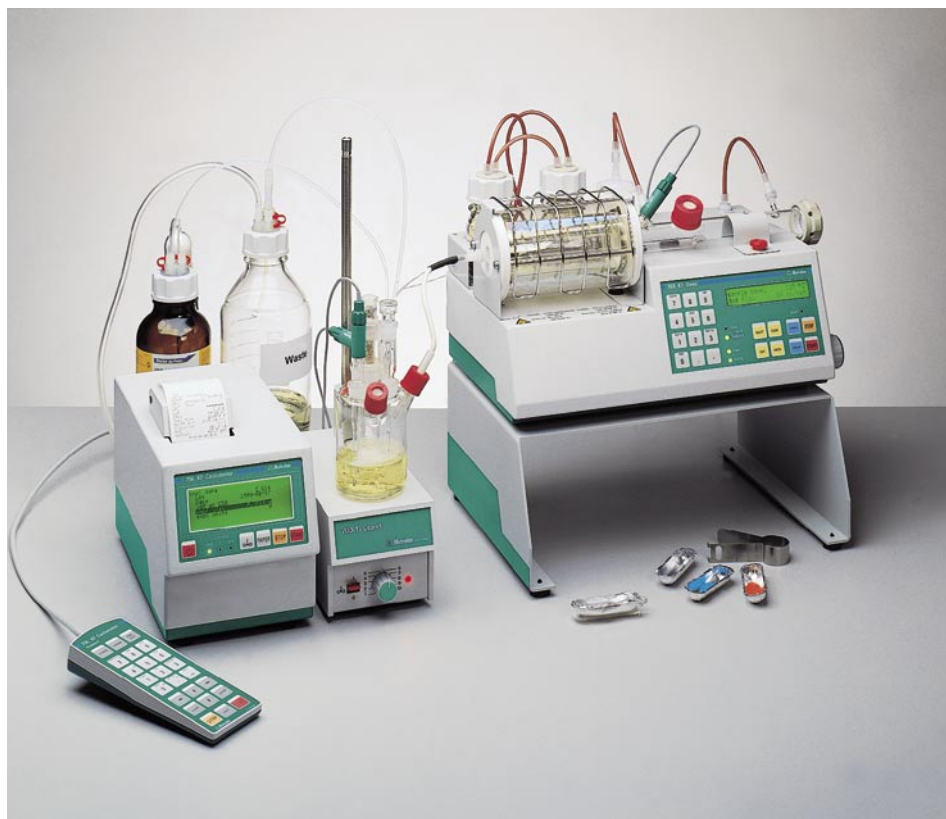
756 KF Coulometer with 768 KF Oven

When the 768 KF Oven is used together with the 756 KF Coulometer the oven parameters are queried by the KF-Coulometer at the end of the determination and inserted into the result report. Thus, apart from the two connecting cables, no additional equipment is required to route the data to the built-in and/or a common printer.