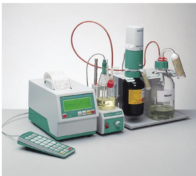
756 KF Coulometer with 700 Dosino for automatically aspirating the titration vessel contents and adding fresh reagent. Dosino and waste bottle are mounted on the 6.2055.100 bottle support.