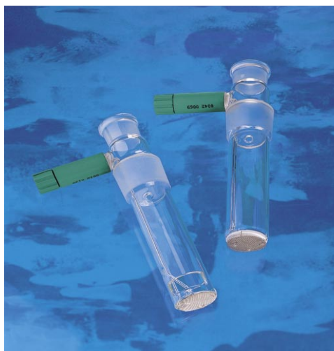
Generator cells for the 756 KF Coulometer: left without diaphragm, right with diaphragm