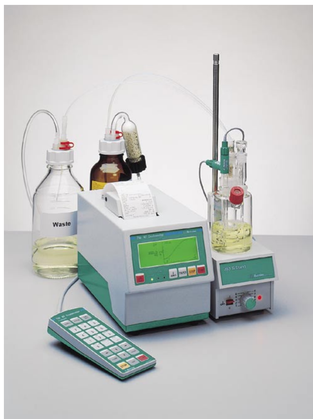
756 KF Coulometer with diaphragm-less cell and 703 Titration Stand for adding fresh reagent and aspirating the spent solution

Different applications demand different instrument settings. If the endpoint has to be adjusted to a different reagent or if an extraction time has to elapse before the start of the determination, the parameters can be adapted via the software and stored as a separate method. The integrated method memory holds about 100 methods. Using the Metrodata VESUV software, additional methods can be transferred to a PC via RS 232C interface and recalled at any time.